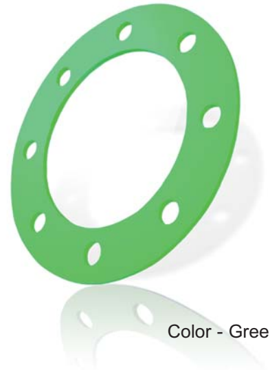
Color - Green